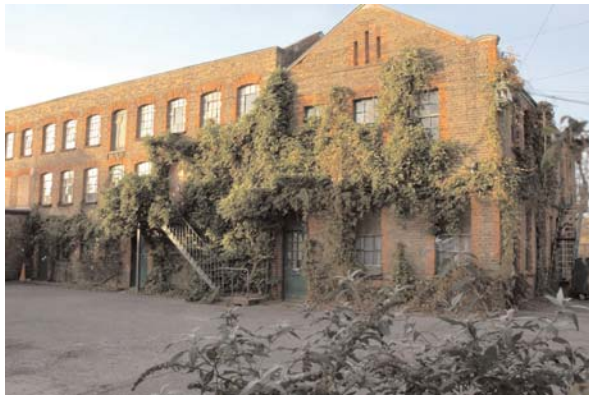
Twickenham Power Station

An application for a large development of flats in the small-scale residential environment of Hamilton and Talbot Roads, between Twickenham Green and the River Crane, triggered a wave of opposition among local residents. This was especially vociferous when it was found that it